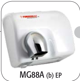
MG88A (b) EP