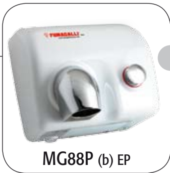
MG88P (b) EP

WARM AIR HAND DRYERS MG 450 ECO LEM New generation: increased performances for reduced drying time. Using less energy and ecologically regenerable.