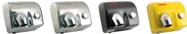
MG88P (l) EP

Other colors available (with push button)