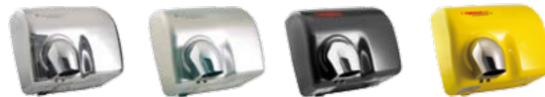
MG88A (l) EP